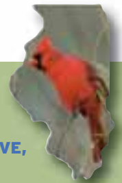
JOE POLASEK DOWNERS GROVE, ILLINOIS