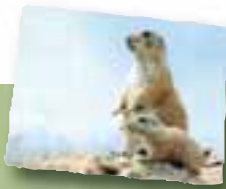
COLIN SOTO THE COLORADO RIVER, COLORADO